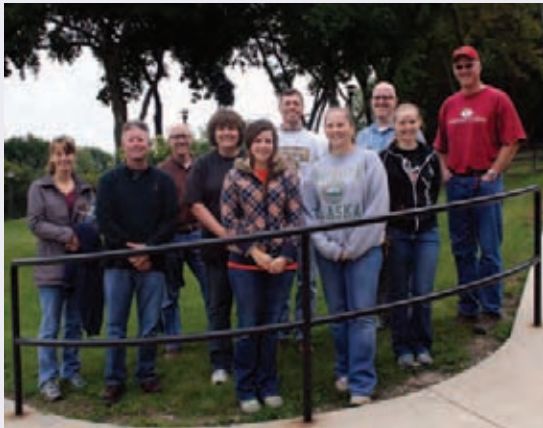
Volunteers from Lessiter Publishing

At Vision Forward, a growing number of volunteers are helping us in a variety of ways to achieve our mission. Last year our volunteer base grew from 250 to 486 volunteers, which includes our partnership with the School to Work Transition Program of Milwaukee Public Schools and corporate volunteer groups from United Way Intern Day of Action, Northwestern Mutual, RW Baird, Lessiter Publishing, Manpower and BMO Harris Bank.